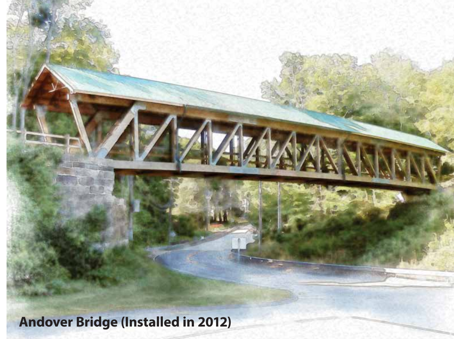
Andover Bridge (Installed in 2012)