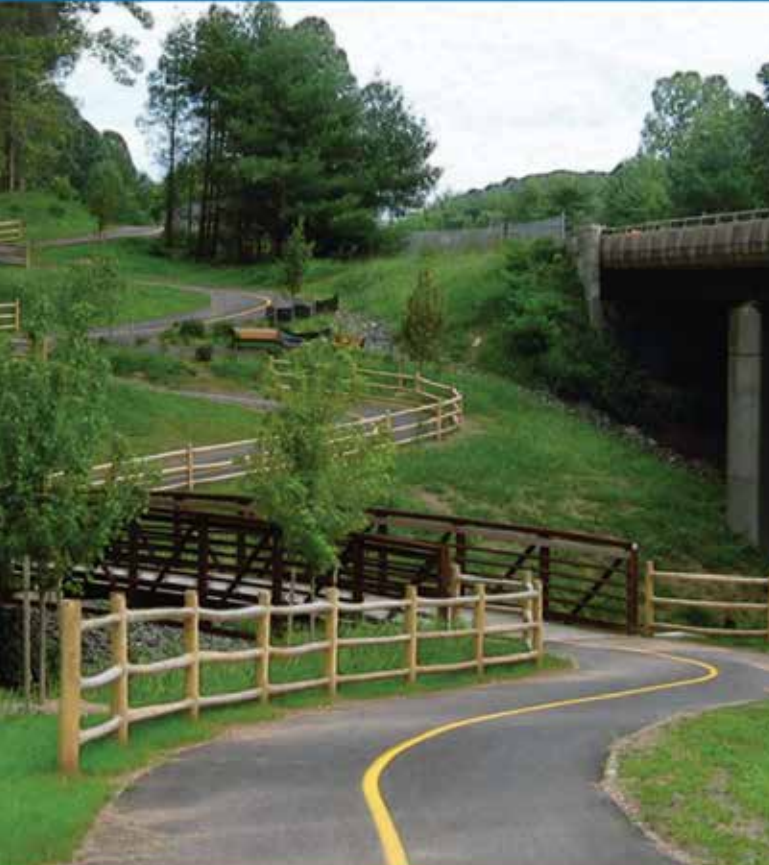
Charter Oak Greenway and Hop River State Park Trail 2025

This map was made possible through the generosity and support of these organizations